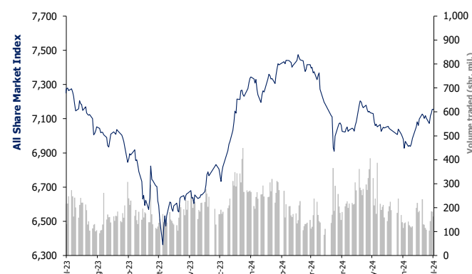
Market Trading Data and Volatility